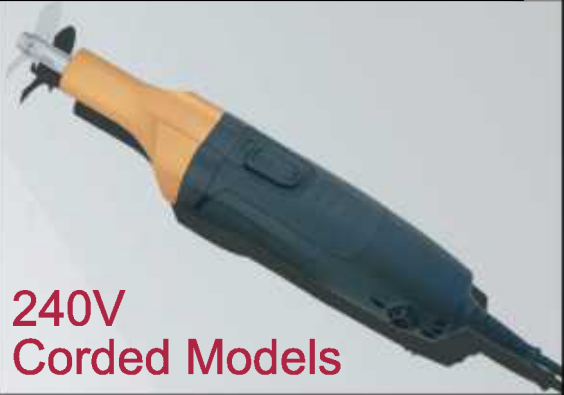
240V Corded Models